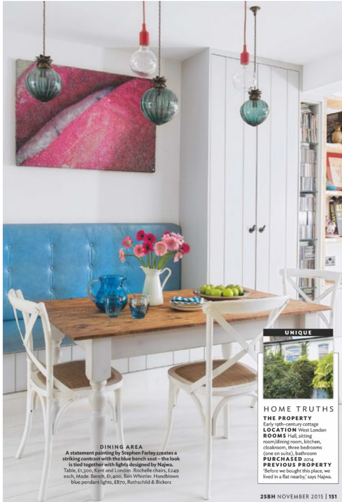
DINING AREA A statement painting by Stephen Farley creates a striking contrast with the blue bench seat – the look is tied together with lights designed by Najwa. Table, £1,300, Kent and London. Rochelle chairs, £249 each, Made. Bench, £1,400, Ben Whistler. Handblown blue pendant lights, £870, Rothschild & Bickers